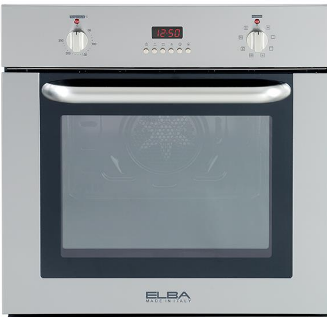
Size: H 595 x W 595 x L 540 mm